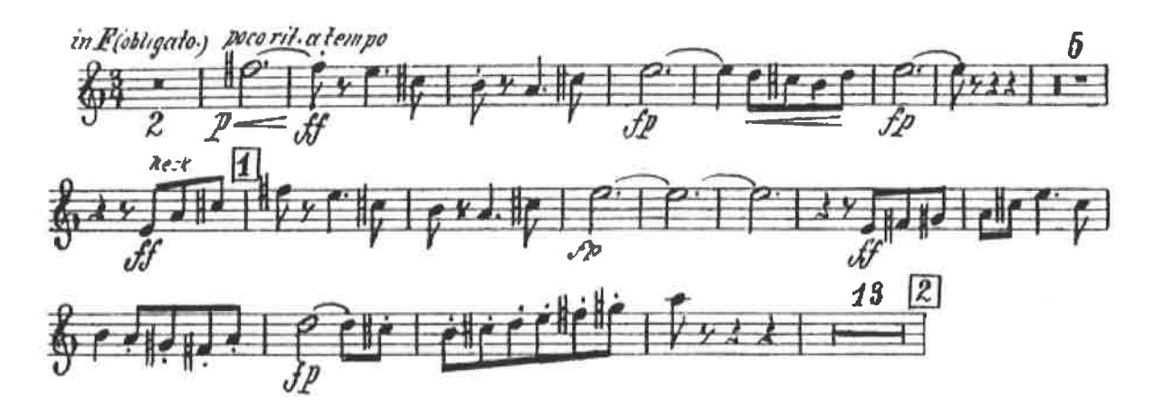
Horn 1 in F